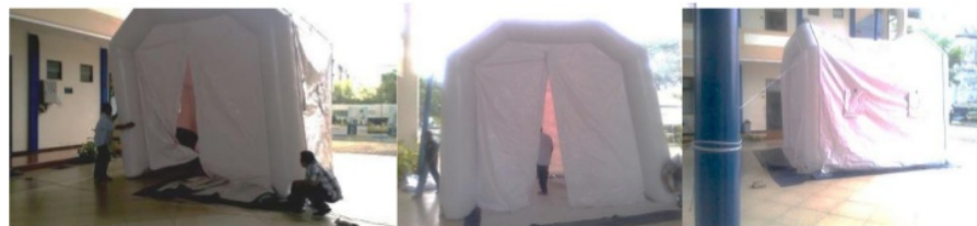
Figure 3. Finishing Process Air inflated Structure