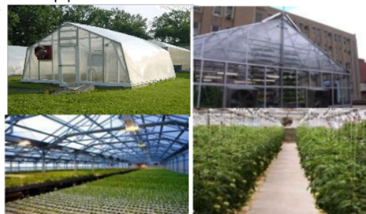
Figure 1. Greenhouse and supporting tools