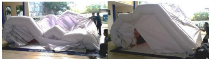
Figure 2. Process Setting-Up Air inflated Structure

"form" of the building using elements / components designed by the students. With the study of the shape of the building through the study of geometry and science will provide the experience formation of structures is difficult and hiperhitungkan mathematically. Greenhouse technology is getting easier with Air inflated Structure technology that can meet the requirements of strength, comfort in the room and speed in the Greenhouse construction. Structure Air inflated membrane material can be resistant to weather up to more than 10 years, depending on the type of material coatingnya (Setiawan, M. Ikhsan et.al , 2014). Besides Air inflated membrane Materials Structure proved to be reliable based on lab testing Narotama and Field Test, give satisfactory results include strong tensile test up to 218.3 kg, material durability > 70 0 C, 3 minute installation and 3 minute dismantling and temperatures in room <35 0 C (Setiawan, M. Ikhsan et.al , 2015 (a)). Structure inflated water can be used in a confined area, lightweight structural materials (PVC 0.55mm tarpaulin), easily removed, folded and transported to another location just by truck / pickup (Setiawan, M. Ikhsan et.al , 2015 (b))