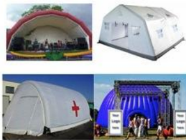
Figure 1. Various Functions Tent With Frame Structure which Inflated Air (Air inflated Structure)

Pneumatic structure is a system of building structure tent constructed from thin sheets of flexible material, stabilized by the pressure difference with the medium: gas liquid, foam, or fine grain materials. When the flexible membrane composition given medium that causes a pressure difference, it forms a pneumatic ("pneuma" which means bubbles filled with air). Inflated membrane able to withstand the forces of the outside, because it turns into a pressure medium and medium holder into element thus forming a pneumatic load-bearing structure (Hery, 1992; Herzog, 1976). Building a tent with a material that weighs no more than 3 kg / m 2 is able to shade the soil with a span of more than 100 meters (Otto, 1973) despite using pressure difference is not too great between the inner and outer space (Luchsinger, at.al., 2004), How to work with a tent pole structure inflated with air is as follows: Air pressure is used to inflate the forms (eg: arc, beams, columns) that is used to support the building cover (Schodek, 1980). The air pressure inside and outside of the building is the same (Figure 2).