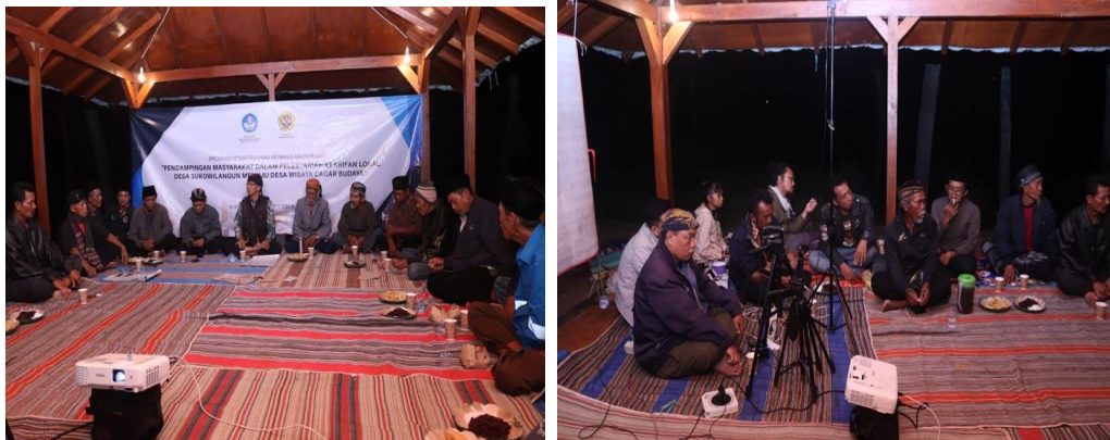
Figure 3. Petrabaja Community Cultural Workshop(Data Serve, 2023)

The second activity is the implementation of a cultural sarahsehan after the floor and supporting facilities have been equipped at the service location. This activity was held with the help of the participation of the local community and the young generation there. The addition of these facilities increases the level of participation so that the number of participants taking part in the sarahsehan has increased, from initially only 18 people, now growing to 25 people.