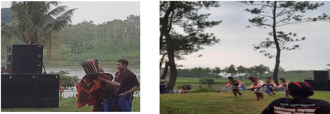
Figure 4. Jaranan Turinggo Setyo Cultural Ritual (Servant Data, 2023)

The third result that has been carried out is a cultural documentary of cultural activities in Sukowilangun and around the Petrabaja community. One of the documentaries that can be made by partners and servants is a documentary about the Jaranan Turonggo Setyo Budoyo cultural dance. The music used is a little more modern than jaranan in general. Communities in this area work together with service providers to organize performances to document the process of implementing the uri uri budoyo. The partner carries out every step of the jaranan procession while the servant carries out documentation in the form of photos and videos. The process of making the video takes place according to the conditions of the wedding and birth rituals to be documented. After that, a complete version of the religious and cultural rituals around the Petrabaja community was created.