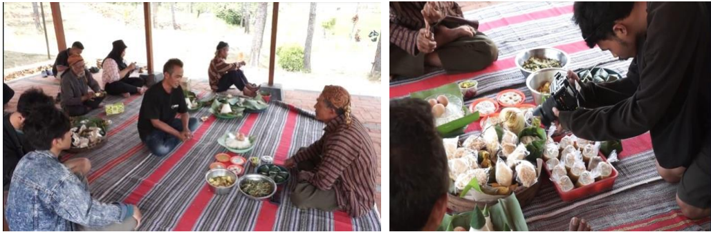
Figure 5. Cultural Rituals and Documentary Video Making (Servant Data, 2023)

The fourth result that has been completed is the creation of a video of service activities. This video tells about the jawal process from the first service to the end of the service. The collaboration of various parties in Sukowilangun Village makes a major contribution to creating innovation. The touch of technology provides another color and enthusiasm for the elderly in the Petrabaja community. In other words, these two generations collaborate with each other and create creativity based on local wisdom. An agreement that has been passed down from generation to generation is to respect and preserve the cultural values of ancestors by continuing to hold these rituals in each home.