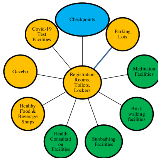
Figure 1. Room Facilities and their functions ( source of 2021)

Spaces that will be used as wellness tourism will be grouped according to their function—starting with Checkpoints, Parking Lots, Covid-19 Test facilities, Registration Rooms, Meditation Facilities, Brisk Walking facilities, Sunbathing facilities, Health Consultation facilities, Gazebos, Toilets, Lockers, and Food and Beverage Shops.