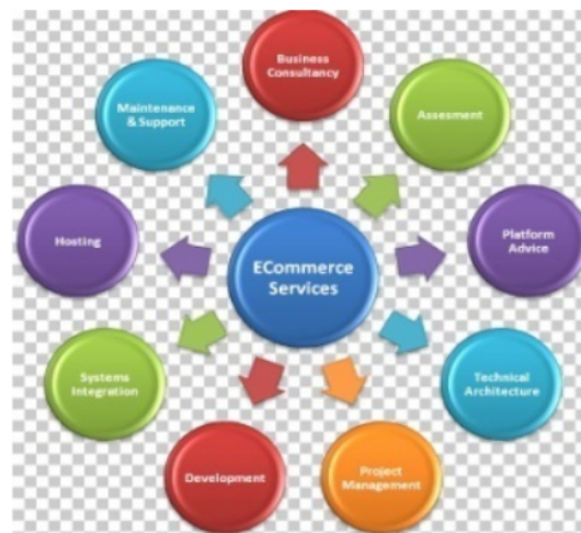
Fig. 1: Business-To-Business Ecommerce services

Net development corporations and, heaps of usually, digital marketer's area unit business-to-business services that handle the creation and maintenance of company websites, and completely different digital advertising services like content creation and bug improvement. These services area unit indispensable inside the ever-expanding digital surroundings that dominates the modern business landscape. Though web development corporations failed to exist till a handful of decades past, they need become essential partners for any business that desires to induce off very cheap. Otherwise known as e-procurement sites, these corporations serve a spread of industries and sometimes specialise in a definite section market. a company agent can get provides from vendors, request proposals and even produce bids for purchases at specific prices. These business-to-business websites modify the exchange of product provides and acquisition.