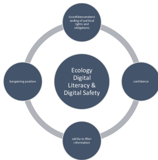
Figure 2. Ecology Digital Literacy and Digital Safety (Literature treat by researcher, 2022)

The digital literacy ecology is formed with an understanding of women's political rights and obligations. Second, women must have confidence in mastering the ongoing political discourse. This action helps women to make decisions more quickly and protect their rights. Third, the ability to filter information makes it easier for women to understand situations. Moreover, lastly, for women to have a bargaining position to step up in exercising their political rights.