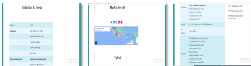
Figure 3. Higher Education Faculties and Study Programs

The directory arrangement starts from college name, college logo, faculties and study programs owned by universities, college social media, college address displayed using maps, college gallery, general information on tertiary institutions includes the status of tertiary institutions, accreditation of tertiary institutions, rankings of tertiary institutions, facilities, tuition fees, registration information, and cooperation carried out by tertiary institutions.