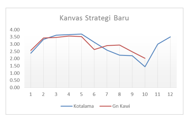
Figure 2: The new strategy canvas