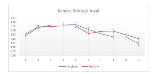
Figure 1: Canvas strategy early

and understand what the customer obtained from the care Market (Kim & Mauborgne, 2014). For canvas The initial strategy of data used is the result of the average value of recapitulation Kuesioner on Table 3. From the data is obtained in the form of Canvas strategy chart as follows: