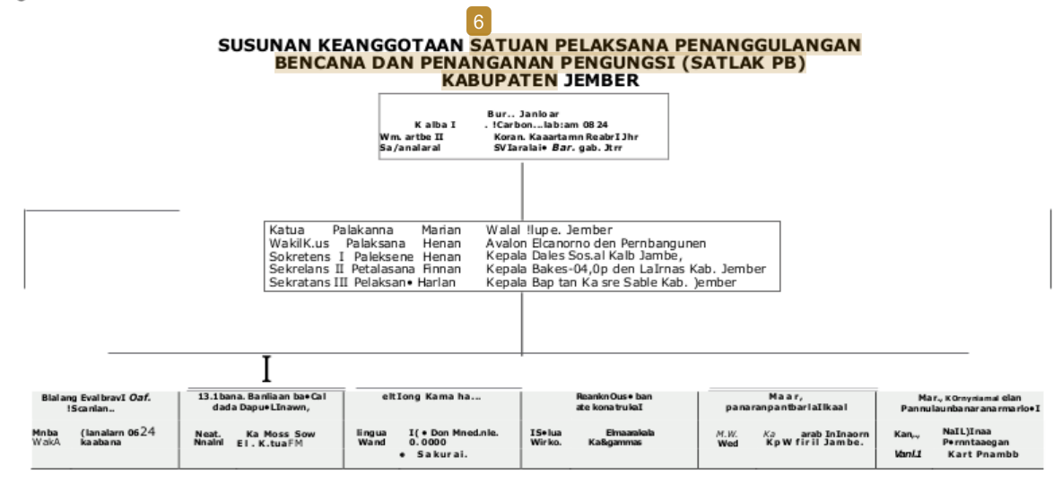
Fig. 3. Satlak (management order) of Jember Regency Government [5]

disaster according to minimum service standard, b) protecting societies from disaster's impact, c) reducing disaster's risk and integrating reduced disaster's risk by development program, d) allocating fund of disaster handling in anggaran pendapatan dan belanja daerah (APBD) in sufficient manner. Jember Regency until now still haven't got BPBD, as far as I know it is enough to be implemented by Satlak that consist of executive element, PMI, Linmas, Social Agency, PU Agency, Health Agency and external element that concern with disaster incident. Organization structures in it would be as follows.