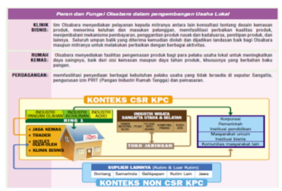
Fig 2.Scheme of Olsabara's Role and Function in Local Business Development

Olsabara which was inaugurated in May 2013 continues to improve its services as Sangatta's outlet center, business clinics, container houses, and trading functions. In 2016, the total transactions that occurred amounted to Rp 1,108,906,678, with the large 2 sales being AmplangBengalon. The total visits were 7,430 or an average of 619 people / month and the percentage that made transactions was 55% of the total visits. Total product suppliers of 95 food businesses and 66 non-food businesses.