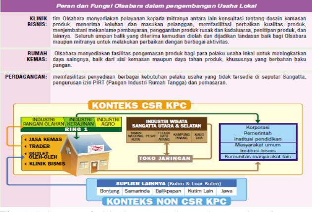
Fig 2.Scheme of Olsabara's Role and Function in Local Business Development

Olsabara which was inaugurated in May 2013 continues to improve its services as Sangatta's outlet center, business clinics, container houses, and trading functions. In 2016, the that occurred total transactions amounted to Rp 1,108,906,678, with the large sales being AmplangBengalon. The total visits were 430 or an average of 619 people / month and the percentage that made transactions was 55% of the total visits. Total product suppliers of 95 food businesses and 66 non-food businesses.