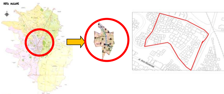
Figure 2. Reasearch Area

The focus of the study are the settlements located in the Kidul Dalem Village, Malang. Also known as Embong Brantas, this area consisted of 7 RT (neighbourhood association) with \pm 1000 residents with an area of \pm 2,4 ha.