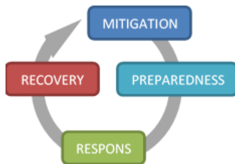
Figure 1. Disaster Management Cycle

The activities in each of the stages above are interrelated and formed a cycle of an experience that later will become an input for preparation in the event of a disaster in the future. This experience will provide important input for better mitigation and preparedness which will result in a better response as well.