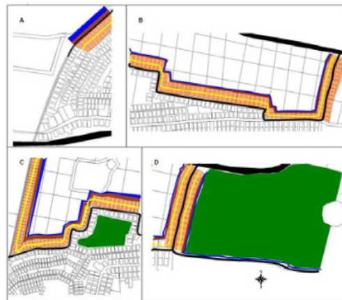
Fig. 2b. The CDL factors in every part of existing housing

Therefore, in addition to the notation used color coding scheme for the determination of residential use is also required a clear boundary line between housing development and existing housing (Fig. 2a and Fig. 2b). This