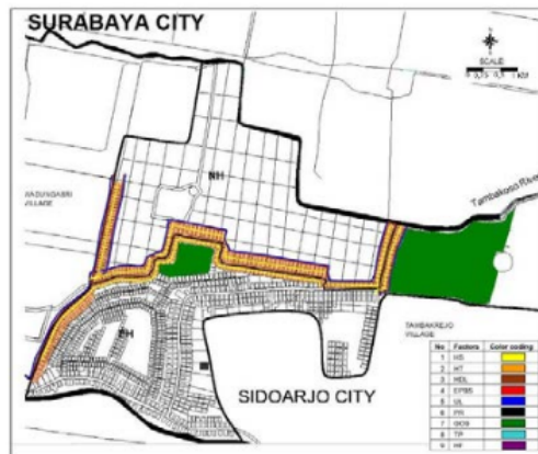
Fig. 2a. The CDL factors on housing development in Tambaksumur village

The land use map is the most common of the land-based presentation of data. In general, land use is shown in a different color. The map illustrates the land use effectively use the concept of land-uses graphic displays, roads, public infrastructure, and community facilities. There is a deviation in the planning and implementation, specifically on the residential use on the land use map in Indonesia does not distinguish tagging for project-based housing development. Because the color coding scheme used is already commonly used in every plan, then it is ignored. Developers do not have a guide to distinguish the extent to where they should not do development under land use control of local government.