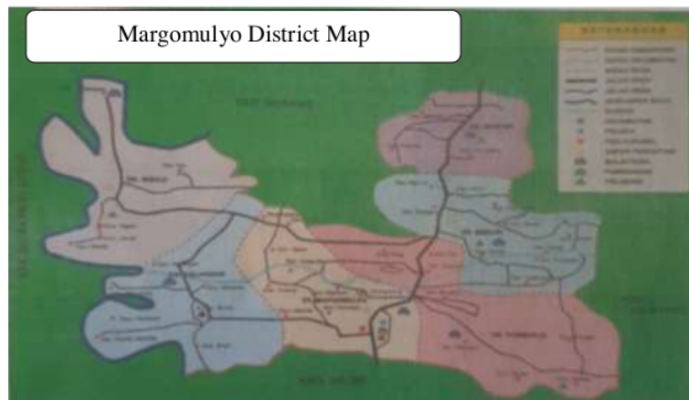
Figure 3. Margomulyo District Map

Japanese Hamlet is one of the eight hamlets included in the area of Margomulyo Village, Margomulyo District, Bojonegoro Regency, East Java Province. This Japanese hamlet is approximately four and a half (4.5) kilometers from the Margomulyo village office, approximately three and a half (3.5) kilometers from the Margomulyo sub-district office, approximately 70 kilometers from the capital city of Bojonegoro district, and approximately 250 kilometers from the capital city East Java Province. The Japanese hamlet covering an area of approximately 74.76 hectares is divided into two RTs, namely RT 1 and RT 2, RW 5. RT 1 is located at the top, and is limited by hamlet roads. While RT 2 is located at the bottom close to rain-fed river water flow (not permanent). In RT 2 the majority is inhabited by the Samin community.