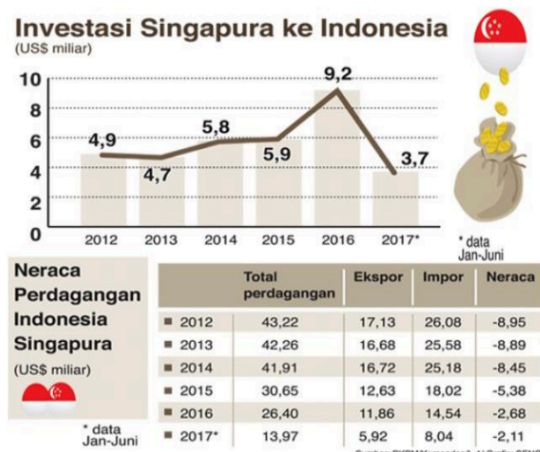
Figure 1. Singapore's Investment to Indonesia

Cooperation of Ministry of Foreign Affairs stated that the strong bilateral relationship between Indonesia and Singapore can be seen from the intensity of meeting and visitation of both countries. In addition, the two countries have bi-annual summit meeting known as leader retreat .