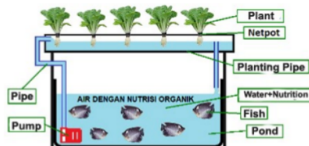
Figure 1. Hydroganic system

Hydroganic comes from the words "Hydro" and "Organic" which are defined as organic cultivation systems by combining the hydro system and the organic system. The main source of nutrition from hydroganic is obtained from solid and liquid organic fertilizer and pond water which is treated as plant nutrition (Yeniarta. 2017).