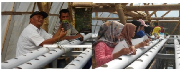
Figure 7. Socialization of Hydrogamic Agriculture

Discussions in the form of and coordination were carried out in the field where hydropower was planted and in the house of the Head of Grangsil Hamlet.