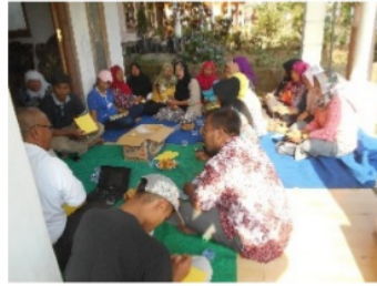
Figure 8. Coordination of the Hydroganic Management Team