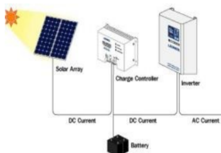
Figure 2. Photovoltaic Solar Energy Systems

Balance of System (BOS) required includes a charge controller and inverter, an energy storage unit (battery) and other supporting equipment (Widayana, 2012). This energy system will support the electricity needs of circulating water pumps that pump water from ponds to the pipe pipes where hydropower vegetables are planted.