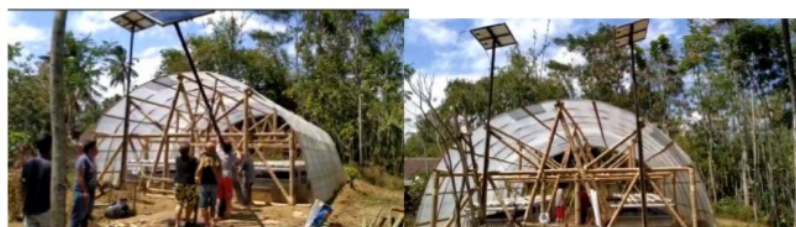
Figure 6. PLTS Installation (2 days)

Installation of Solar Power Plan installations include: solar panels, brackets, solar controllers, batteries, inverters, and cable networks leading to water pumps and lighting lamps carried out by the Unmer Malang Community Service Team assisted by the people of Jambangan Village. Installation is carried out within 2 days.