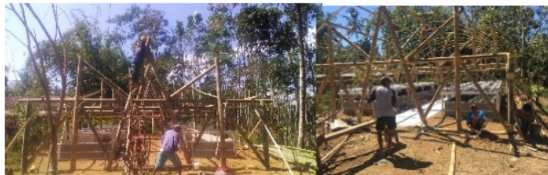
Figure 4. Construction of a Greenhouse (15 days)

The construction of a greenhouse with a bamboo structure was carried out cooperatively by the Grangsil hamlet community assisted by Unmer Malang students who were doing a Real Work Lecture. It takes 15 days to complete the construction of a greenhouse with a bamboo structure.