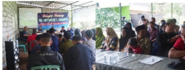
Figure 9. Hydroganic Agriculture Workshop

Hydroganic agriculture workshops include: an understanding of hydroganic farming, how to make hydroganic media, how to plant and maintain hydroganic plants carried out at the "Dream Workshop" in Kanigoro Village, Pagelaran District, Malang Regency.