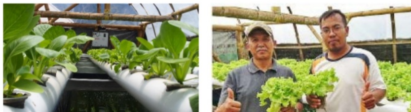
Figure 10. First Harvest of Lettuce Vegetable

Planting lettuce and mustard greens as well as spreading catfish and tilapia in mid-August 2019, lettuce vegetables can be harvested at the end of September 2019. The success that can be seen is that when farmers cannot grow vegetables in dry land, the vegetable plants in this hydroganic greenhouse remain fertile and healthy because water circulation occurs continuously. Tunnel-shaped greenhouse with bamboo structure using independent energy for hydroponic farming is very practical, efficient and quick to build and can be planted with vegetables and spread fish throughout the year without pause is expected to be a prototype of modern agricultural and fishery facilities without relying on the rainy or dry season in the framework of the program increase national scale food safety.