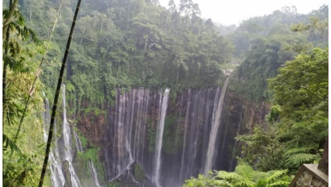
Figure 1: View of Tumpak Sewu Waterfall, Lumajang Regency

Ilham Dwi Arinta et al, East African Scholars J Econ Bus Manag; Vol-5, Iss-7 (Aug, 2022): 185-188