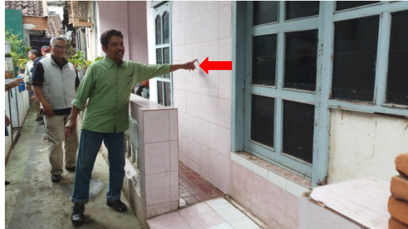
Fig.1. Flood level mark at the study area