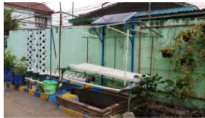
Photo 3. The installation of solar cell to supply energy for circulating water from the drainage channel

The following are some of the findings that are also indicators of the SDGs as mentioned above, describing the success of the efforts undertaken: (1) 6% of residents get access to drinking water from Municipal Office of Drinking Water Supply, and the rest from water sources in the kampong that are feasible and continuous. (2) Glintung Kampong is involved in strengthening the programs of several institutions, including: the East Java Regional Police through the Self-Resilient Kampong Program in adaptation to the Covid-19 pandemic; the Department of Agriculture through the Food Security Village Program; the Tourism Office through the Tourism Awareness Group; the Public Works Department through the Flood Resilience Kampong Program; and the Environmental Service through the Communal Septic Tank Program. (3) Glintung Kampong develops its urban farming by reusing water in drainage channels for fish and vegetable cultivation. Energy supply for urban farming operations is obtained from hybrid energy sources, namely electrical energy and solar energy. The solar cells to generate energy for circulating water as seen in Photo 3. Furthermore, the use of water turbines will also be developed as an alternative energy supply (Photo 4). (4) Almost 100% of houses have toilets, but 50% are without septic tanks. However, through the Environmental Service Strengthening Program, communal septic tanks have been built.