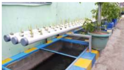
Photo 2. Retrofitting the drainage channel for fish cultivation, and water reuse for vegetable cultivation

To reduce the inundation height that occurs in the kampong, in 2018 the Malang City Government , through the Public Works and Spatial Planning (PUPR) Agency , constructed a drainage channel with a total length of 40 meters. The channel consists of two canal sections, the northern section along 24 meters and the western section along 16 meters. On the initiative and collective action of the local community, the drainage channel was modified so that it can also be used for fish and vegetable cultivation following a concept of urban farming. Modifications were made by retrofitting a vertical filter partition on several segments, which is used to filter water and keep fish from drifting away. The drainage channel modification is shown in Photo 2.