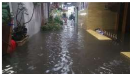
Photo 1. Inundation height during and 30 minutes after stormwater event.