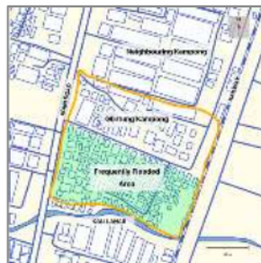
Figure 1. The Situation map of Glintung Kampong location, bordered by the main road (at the west), higher density neighboring kampong (at the north), railroad (at the east), and Kali Lahar (at the East)

14 The study area is located in East Java Province, which is the province with the second largest population in Indonesia. The research object is Glintung Kampong, which is a flood-prone area in Malang City, the second largest city in East Java Province. Glintung Kampong is also known as Glintung Water Street (GWS). The name GWS was inspired by the function of the roads in this kampong which turn into channels during heavy rain, especially on roads that are within a radius of \pm 100 m from the main drainage channel. Since the beginning of 2000, almost 50% of the area has been flooded every rainy season with an average flood height of 0.7 meters and a maximum of 1.5 meters. The kampong is bordered by a main city drainage channel, known as Kali Lahar, about 12 meters wide in the south. In the west it is bordered by a highway connecting two major cities in East Java Province, Malang and Surabaya. In the northern part, the kampong is bordered by a neighbouring kampong which is densely populated and at a higher elevation. In the eastern part there is a railroad with a higher position than the kampong. Therefore, the GWS kampong is like a pond during stormwater events. The condition worsens due to a backwater flow when the water level in the Kali Lahar increases and water overflows into the kampong. The location map of Glintung Kampong and the kampong condition during stormwater event are as shown in Figure 1 and Photo 1.