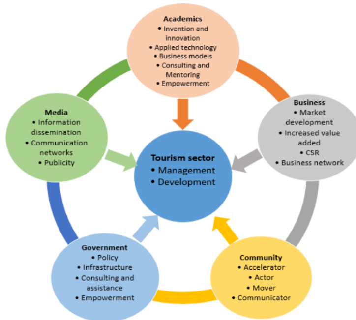
Figure 2: Pentahelix synergy in tourism development

The government's alignment with developing tourism in Indonesia is marked by the recognition of this sector as one of the economic pillars, especially in bringing in foreign exchange, increasing regional income and absorption of investment as well as reducing unemployment by opening up many new jobs. However, the development of this sector cannot only depend on the government, given that many parties are involved and have an interest. Therefore, there is a need for synergy in the management of the tourism industry, especially when faced with the situation in this new normal era. The pentahelix synergy in Batu City tourism development is as shown in the following figure: