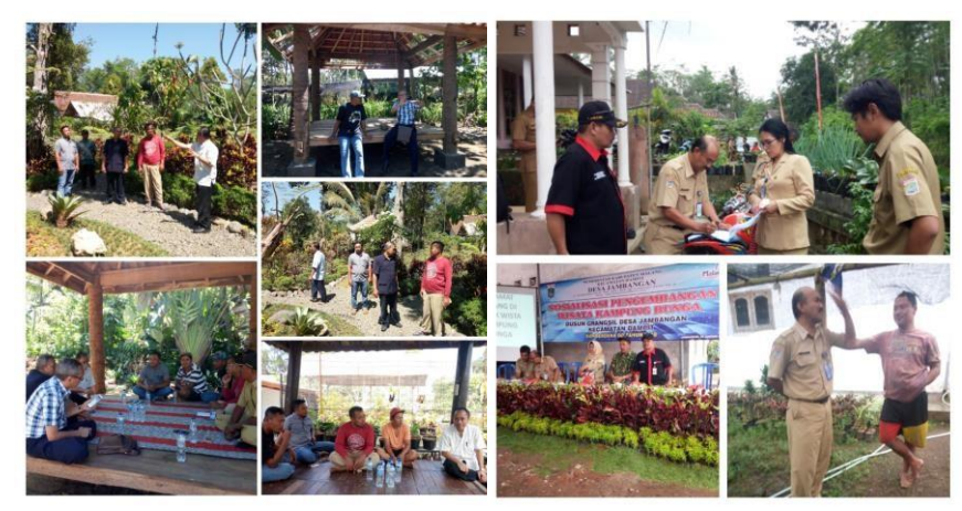
Figure 2. Socialising, brainstorming, and exploring the possibility of developing KBG into a tourism village