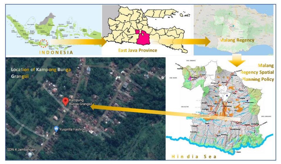
Figure 1. Location of Kampoeng Boenga Grangsil (KBG)