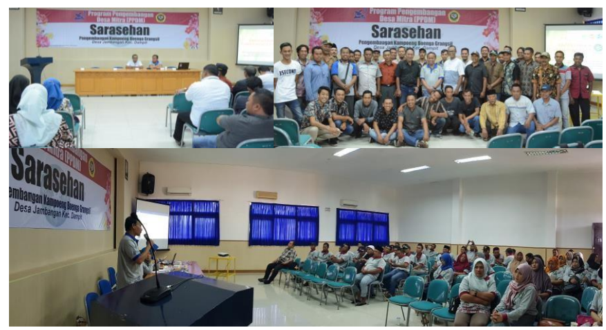
Figure 5. Brainstorming through ex-situ assistance

The difference in the level of participation is strongly influenced by understanding the importance of the tourism village development programmes (Hidayati et al., 2016). The Tourism Awareness Group has the lowest rate (45%) because most of its members are not natives of Grangsil and do not see the direct benefits of development.