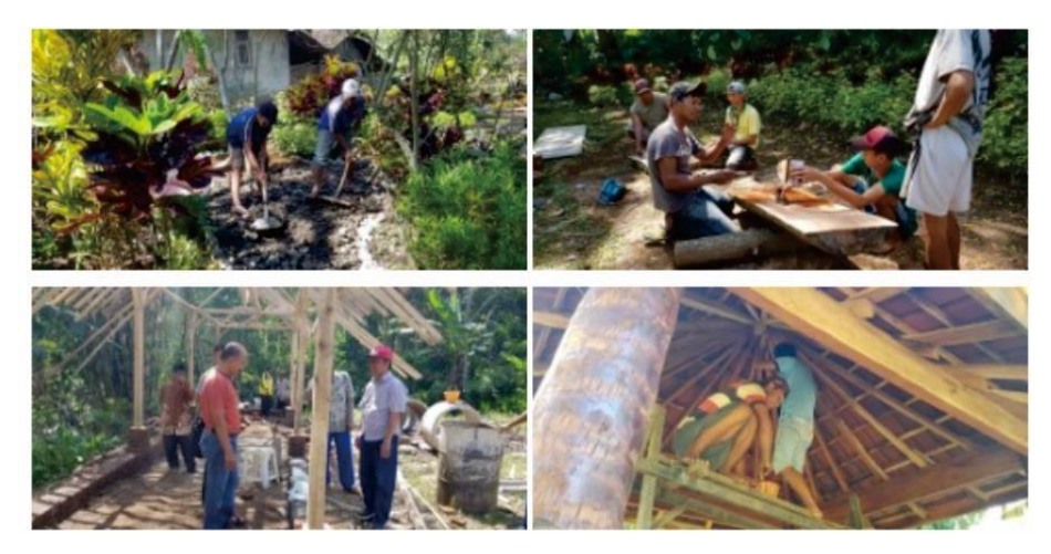
Figure 7. Cooperative activities to build facilities at KBG

Supporting social capital can motivate the Grangsil community to achieve its potential ( Figure 7 ). They have so far successfully organized themselves to realize their KBGs. With POKDARWIS (Tourism Awareness Group), the Grangsil community set a target of achieving KBGs by integrating agricultural land with their collective home gardens. This collective awareness arises because of social solidarity ( Table 3 ). Social capital raises collective awareness and thereby increases the participation of the Grangsil community. Community empowerment efforts are essential to the development process of sustainable tourism villages (Wikantiyoso et al., 2019). According to Durkheim (Oosterlynck & Bouchaute, 2013), social solidarity creates a collective consciousness, which will be able to become a driver of development. From a mutual understanding of the need for progress, the camaraderie developed by building their facilities together in order to improve their standards of living became a very potent social capital.