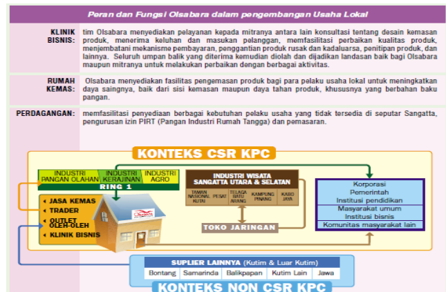
Fig 2. Scheme of Olsabara's Role and Function in Local Business Development

Olsabara which was inaugurated in May 2013 continues to improve its services as Sangatta's outlet center, business clinics, container houses, and trading functions. In 2016, the total transactions that occurred amounted to Rp 1,108,906,678, with the largest sales being AmplangBengalon. The total visits were 7,430 or an average of 619 people / month and the percentage that made transactions was 55% of the total visits. Total product suppliers of 95 food businesses and 66 non-food businesses.