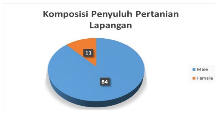
Figure 2. Composition of Agricultural Agency in Sumba District

None of the institutions used as research samples endorses gender policies and programs.