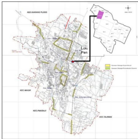
Figure 1: Glitung Gg I

of costs, benefits and social values, especially to the community [34].