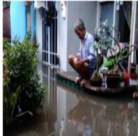
Figure 2: Inundation conditions in residents' houses RW 05 Purwantoro Village