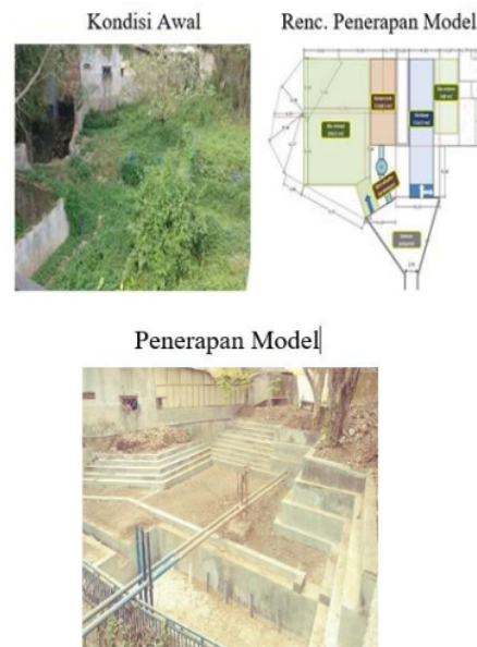
Figure 4 Original Conditions and Drainage Filter Model Implementation Plan