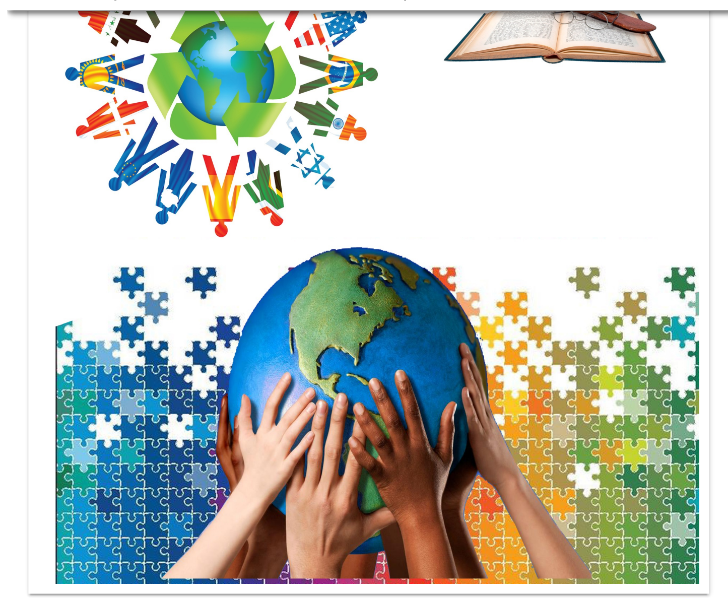
The International Journal of Social Sciences and Humanities Invention

The International Journal of Social Sciences and Humanities Invention an Open Access Publication ISSN: 2349-2031